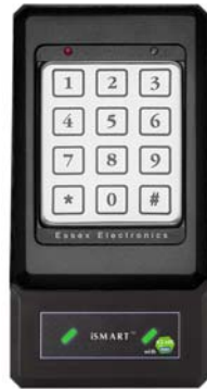
iSMART™ w/ Black Bezel