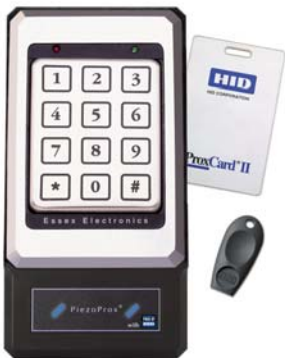
PiezoProx® w/ Stainless Bezel