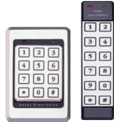
■ 3x4 Keypad (left) and 2x6 Keypad (right)

The KTP Series 12-Pad features no moving parts, rugged stainless steel construction and circuit assembly encapsulation to ensure performance in high use or harsh environments. Ideal for process control equipment and SCADA systems, the KTP-485 Keypad is designed to provide bi-directional serial communications protocol in Hexadecimal 7-bit ASCII data. Configurable in the field, up to 128 keypads can be added on the RS-485 network with selectable parity and baud rates up to 115.2 kbps. Data can be transferred using either Polling Mode for complete master bus control or Event Mode which provides asynchronous data transfers on the bus. The RS-485 connection is slow rate limited and provided with +/- 15KV ESD protection. The RS-485 is available as a 3x4 or 2x6 Keypad. Custom graphics are available.