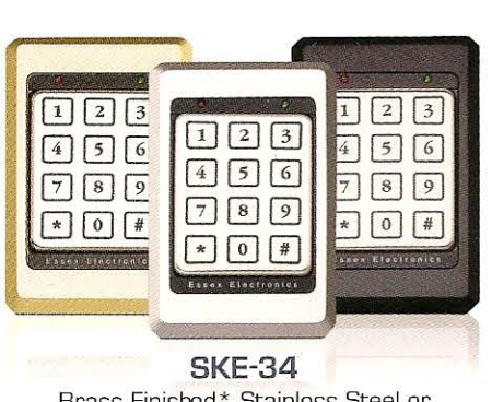
Brass Finished*, Stainless Steel or Powdercoated Black Bezel