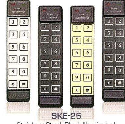
Stainless Steel, Black Illuminated, Brass or Braille Overlay