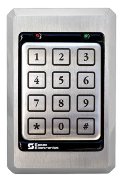
12 Pad 3x4

For over 30 years, Essex KTP Series have become the choice of security professionals worldwide. Advanced Piezoelectric Technology ensures superior performance in virtually any environment.